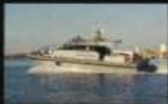
U.S. GSA Expo Preview P. 6