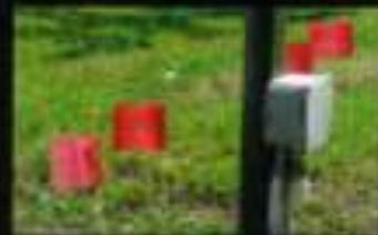
Safety Equipment P. 18